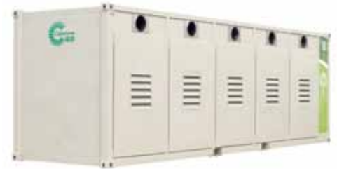
C1000 Power Package